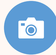
PHOTO AND VIDEO EDITING